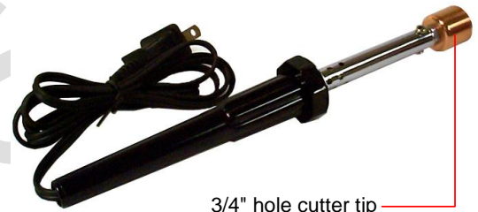
3/4" hole cutter tip

Note: If not replacing the chip, make sure the printer's supply override function is turned on in the printer settings so the printer will continue to print even though the chip has not been replaced.