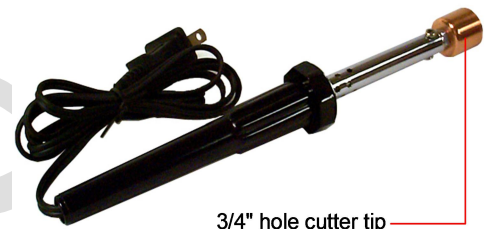
3/4" hole cutter tip

5) Gently shake the cartridge side to side to level the toner. Then reinstall it in the machine and run some test prints.