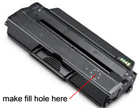
make fill hole here